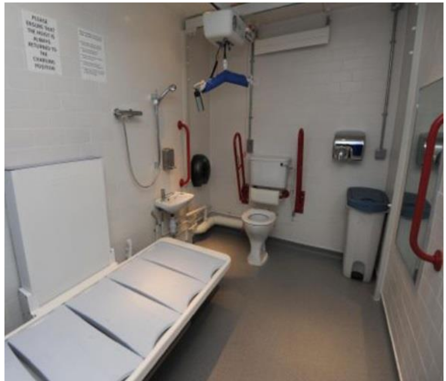
H frame Ceiling Track systems are often used in Changing Places where full room coverage is required for multiple transfers

Changing Places enables users and carers to experience the same freedoms as everyone else including enjoying match day at Arsenal.