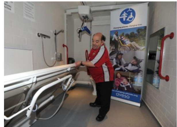
Leroy moves the Height Adjustable Changing Table from the upright position. The Changing Table is supplied with head support and drainage pipe and operated via hand control

Aveso have supplied Changing Places equipment into a range of public places including Stansted and Heathrow Airport, the first Tesco Supermarket and now are proud to add the first Premier League football club.