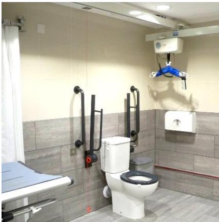
Ceiling Hoist – Air-Side Changing Places Facility