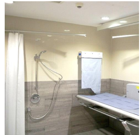
Changing Bench – Air-Side Changing Places Facility

Integrated gas cylinders on the Changing Table enables users to easily fold the surface against the wall themselves if extra floor space is required.