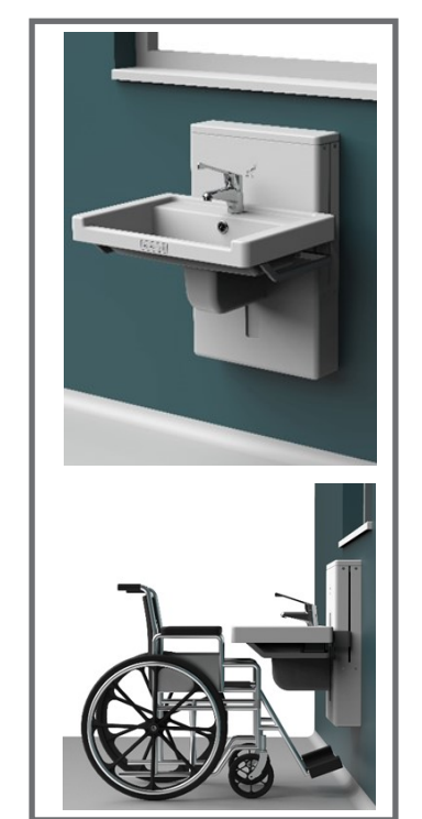
an accessible basin that looks and feels like home

The Astor Aquba can be wall mounted at any height to suit the users.